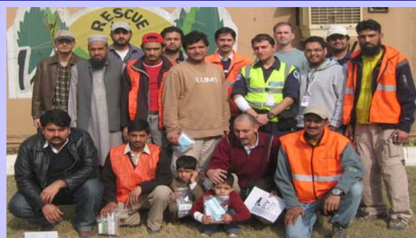
February 2008 - 2 day course on basic life support, rope rescue (knots) and light urban rescue (using cutting tools)