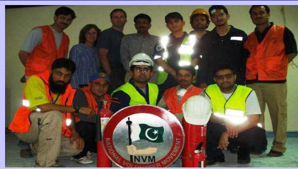
March 2008 - Fire Suppression training

We hope you have enjoyed this special salute to the hard working dedicated voluntary people who are ERT Pakistan's Members .