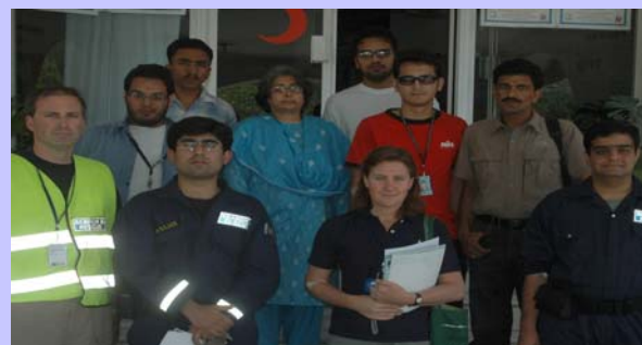
April 2008 - Blood Donation at PRCS, Islamabad

Please make sure you are signed onto Google groups to ensure you continue receiving updates.